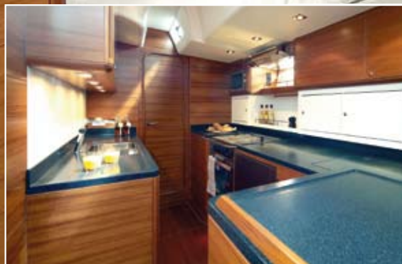
A linear galley along the port passageway is both large and secure, including Force 10 stove, abundant cold storage and optional dishwasher