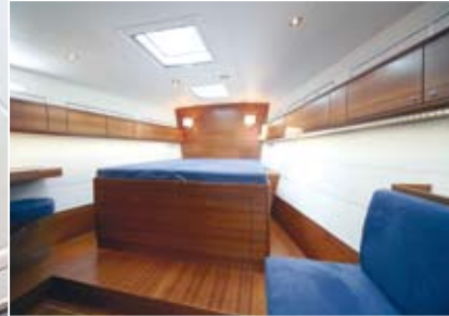
Forward cabin: Were the yacht not destined for the Med, this high central berth would leave rather too much room to fall out each side. Comfortable and smart, however, with a sofa and small vanity table. The ample ensuite has over 7ft headroom and a separate shower is cleverly fitted into the corner

She's still a sailor's boat below. Weight distribution is well thought out, with water and fuel tanks, engine, generator and huge bank of batteries all kept low and central. And there's masses of headroom throughout. All lockers are ventilated, shelves fiddled, corners rounded and lights on dimmers. Berths have sprung mattresses on slats. And there's a large, practical navstation.